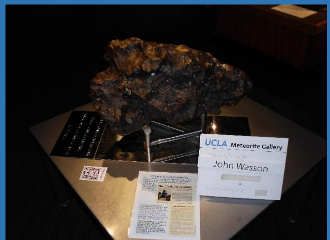
Photos from our field trip to UCLA Meteorite Museum